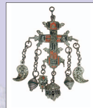
Amulet pendulum from Northeast Bulgaria, 19 th c.

"Camels" is a New-Year ritual with performers masked as camels playing for health and fertility (their "stage property" is presented in the exhibition). Decorated dogwood twigs are a symbol of abundant food and reflect the working and living styles of local people. The twigs are adorned with everything the earth gives and