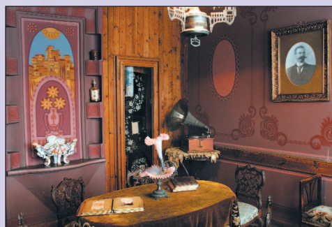
Varna, Guest room, 19 th - the beginning of the 20 th c.