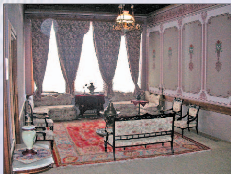
Varna, Parlour, 19 th - the beginning of the 20 th c.

Part of the museum replicates the interior of a wealthy city house from the late 1800's and early 1900's, including parlour, guest room, bedroom and kitchen. There is also some space dedicated to commercial life of old Varna.