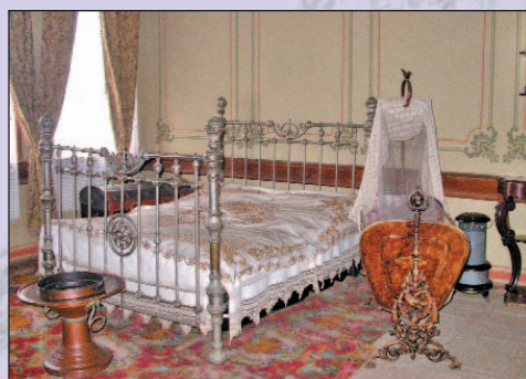
Varna, Bedroom, 19 th - the beginning of the 20 th c.