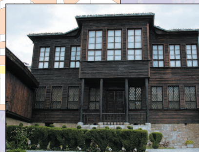
Text: Lidia Petrova