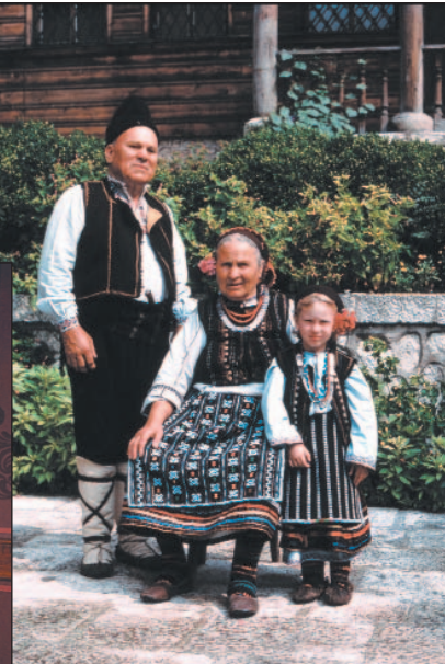
Garbs for men, ladies and children from Asparuhovo, Varna region, 19 th - the beginning of the 20 th c.

intrigued by the wear of local ethnic groups: vaikovtsi, chengentsi, hurtsoi, gagaouzi, as well as immigrants from Yambol and Sliven regions, Macedonia, East Thrace and Asia Minor. Ritual attire includes garments for Christmas, St. Lazarus celebrations, outfit for brides, sisters-in-law and even midwives as they were dressed on Rooster Day. The attire is naturally complemented by charming decorations: buckles, belts, rings, bracelets, earrings, frisettes, under-chins, quavers, pendulums, necklaces. These add conviviality and solemnity to the costumes.