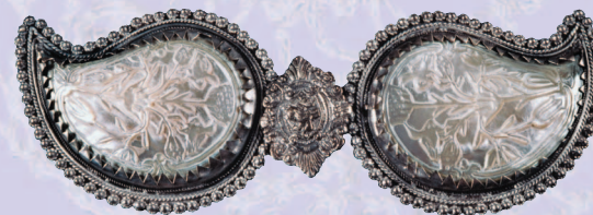
Belt Buckles from Northeast Bulgaria, 18 th - 19 th c.

intrigued by the wear of local ethnic groups: vaikovtsi, chengentsi, hurtsoi, gagaouzi, as well as immigrants from Yambol and Sliven regions, Macedonia, East Thrace and Asia Minor. Ritual attire includes garments for Christmas, St. Lazarus celebrations, outfit for brides, sisters-in-law and even midwives as they were dressed on Rooster Day. The attire is naturally complemented by charming decorations: buckles, belts, rings, bracelets, earrings, frisettes, under-chins, quavers, pendulums, necklaces. These add conviviality and solemnity to the costumes.