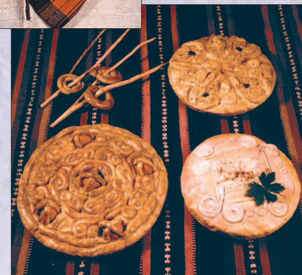
Ritual breads - for Christmas, Easter and weddings from Varna region, 19 th - the beginning of the 20 th c.